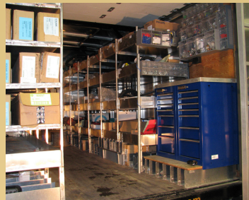
Mobile Lighting Service Centre