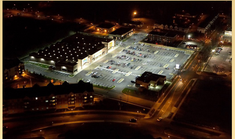
Night Time Safety and Security at Your Property