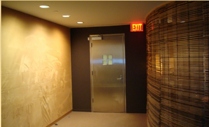
Interior Common Area Lighting