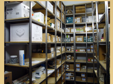
Fully Stocked Warehouse